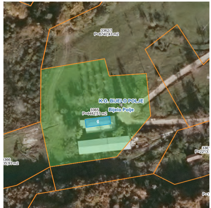
View cadastral plot with a house (GeoPortal Montenegro)

MUNICIPALITY-----BIJELO POLJE CADASTRAL MUNICIPALITY-----KO BIJELO POLJE PROPERTY AREA-----181m 2 PROPERTY PRICE IN EUR-----ON REQUEST ID NUMBER-----ME10283B01001